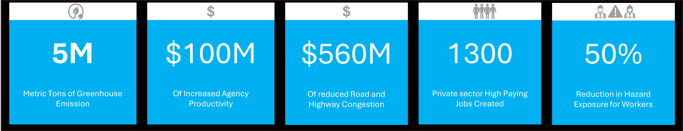
Total Opportunity for Economic Impact