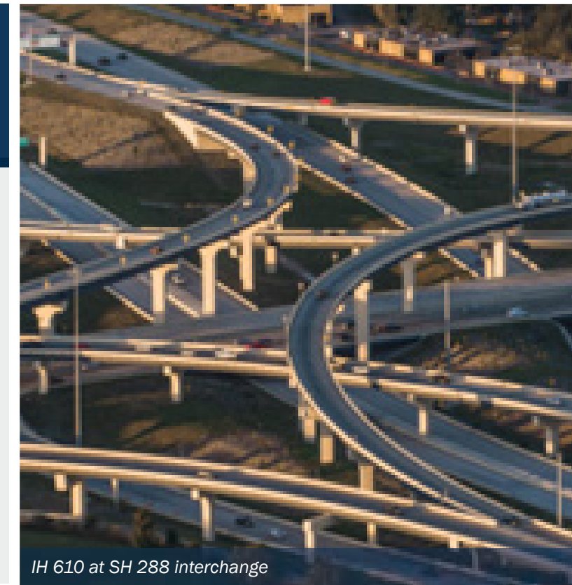
IH 610 at SH 288 interchange