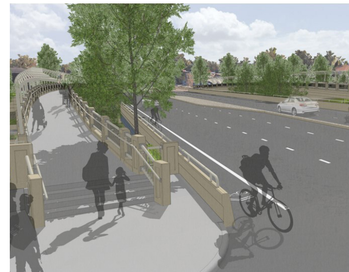
Signature Pedestrian Bridge at Southmore Blvd. added to the project after collaborating with the local community.