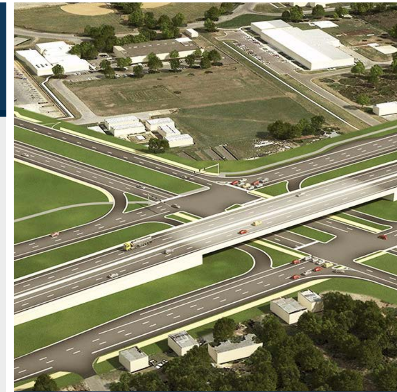
SH 71 at FM 973