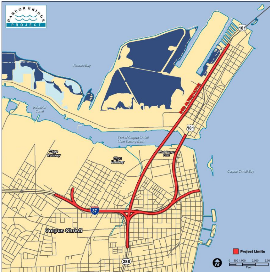
EXHIBIT A PROJECT MAP