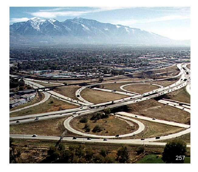
I-15 Reconstruction in the most congested corridor in Salt Lake City, Utah – Completed 4 months early the project's public approval rating increased from 51 percent at project start to 76 percent at completion.