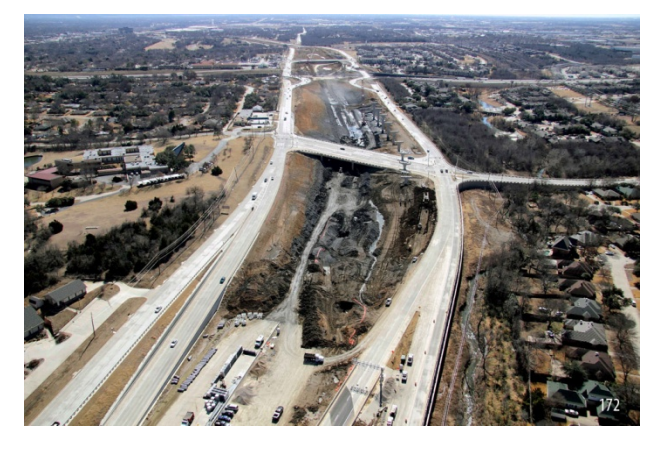
The PLC members have worked with TxDOT Dallas District extensively to deliver complex MOT plans at critical interchanges on the SH 161 Project.

Dallas team will result in a highly productive project team focused on identifying and implementing innovative solutions that will significantly drive down cost and schedule.