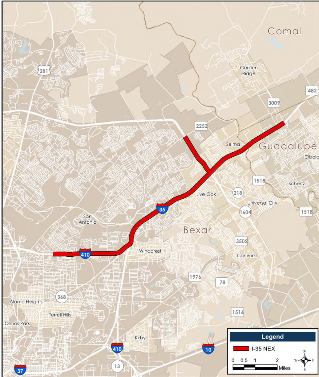
Figure 1-1: Project Map

The Project is generally described to consist of approximately 9.5 miles of non-tolled improvements along I-35 from the I-35/I-410 North interchange to FM 3009, including the portion of I-410 North from the I-35/I-410 North interchange to 0.3 miles east of Nacogdoches Rd. and the portion of Loop 1604 from the I-35/Loop 1604 interchange to Nacogdoches Rd. The Schematic Design portrays the Project in more detail. The Project is located in the cities of San Antonio, Live Oak, Selma and Schertz, in Bexar and Guadalupe Counties.