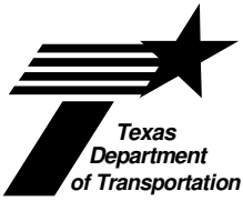
Exhibit A CDA SITE INVESTIGATION ON HIGHWAY RIGHT OF WAY IN THE FORT WORTH DISTRICT

_____ is giving written notice of proposed Work to take place within the right of way of _____ in Tarrant County, TX as follows: