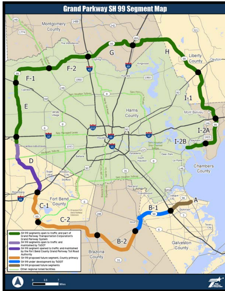
Figure D-1: Map of the Grand Parkway