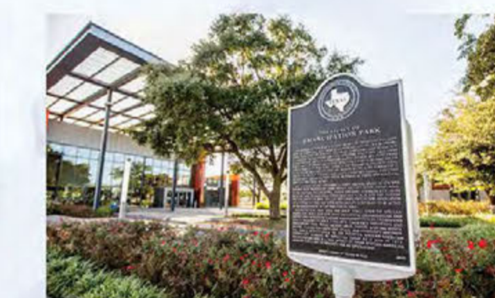
Historic Asset Documentation