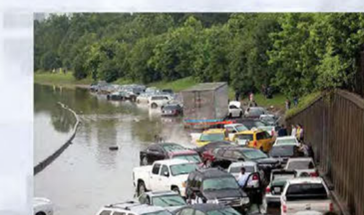
Flood Risk Reduction

Independence Heights, the first African American municipality in Texas, is located within TxDOT's I-45 NHHIP area. TxDOT has committed to preserving the historical significance of this community through actions that enhance storm resiliency, reduce noise, and provide aesthetic improvements, all in support of its rich historic heritage.