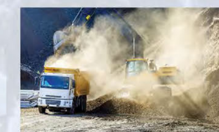
Mitigate Dust & Noise