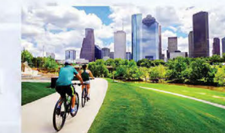
Small Park/ Green Space