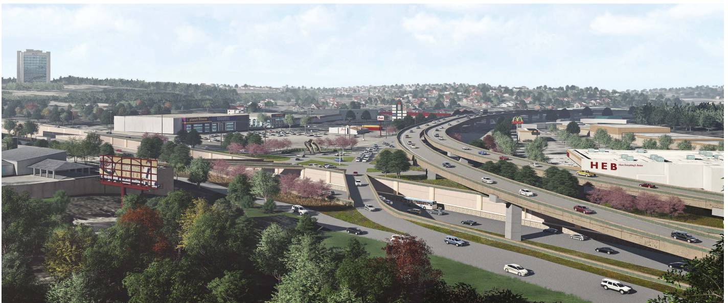
All features illustrated in this rendering are proposed and considered an artistic rendering for conceptual purposes only. Subject to change.

This proposal would require acquisition of new right of way, including four commercial property displacements and one single-family residential property displacement. Other impacts include tree and vegetation removal and the potential for traffic noise mitigation through sound walls.