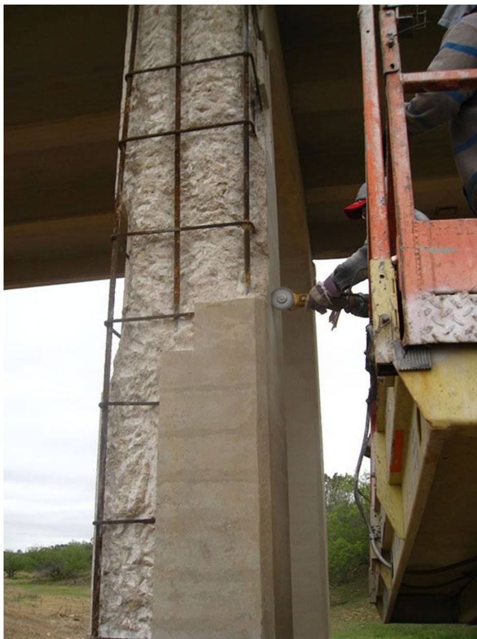
Figure 3-2. Preparation (saw-cutting) straight and squared edges to contain repair material.