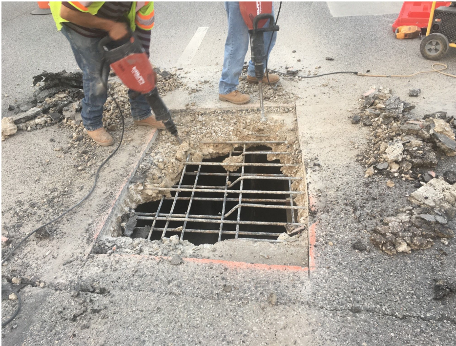
Figure 3-10. Remove deteriorated/unsound concrete