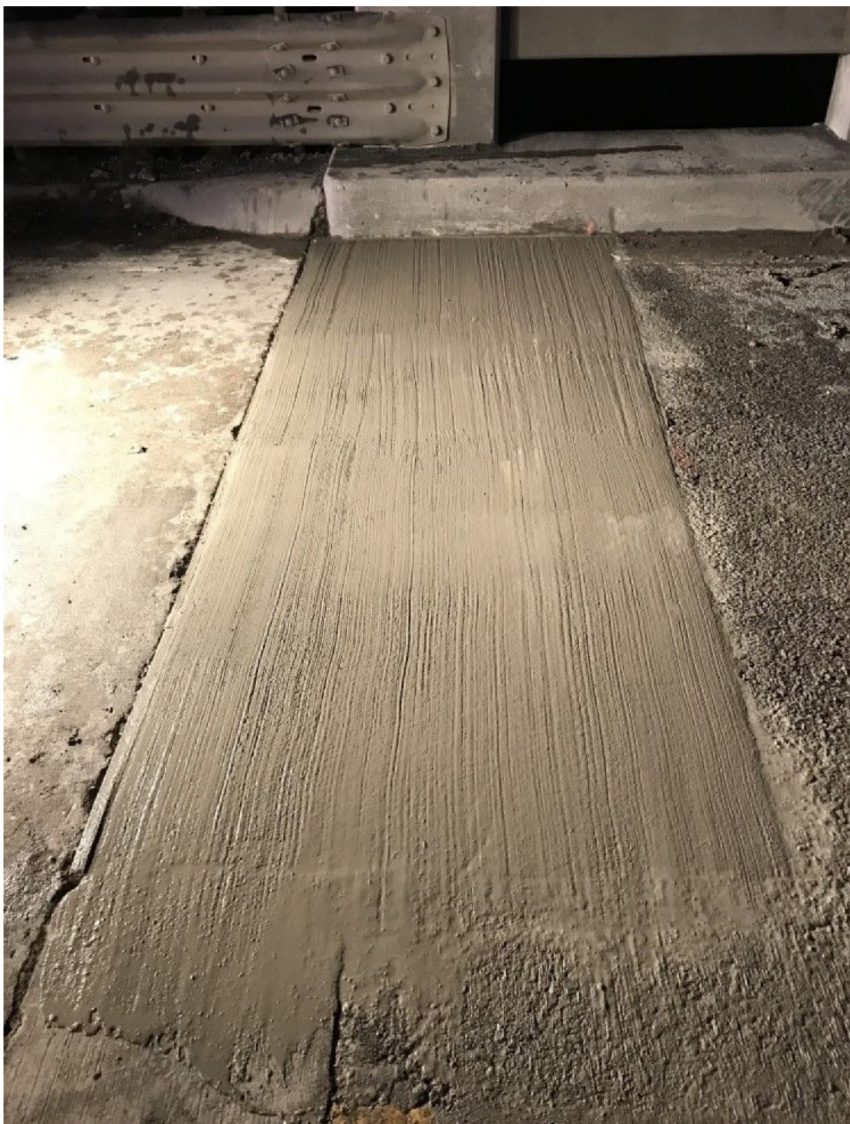
Figure 3-15. Cure and insulate concrete