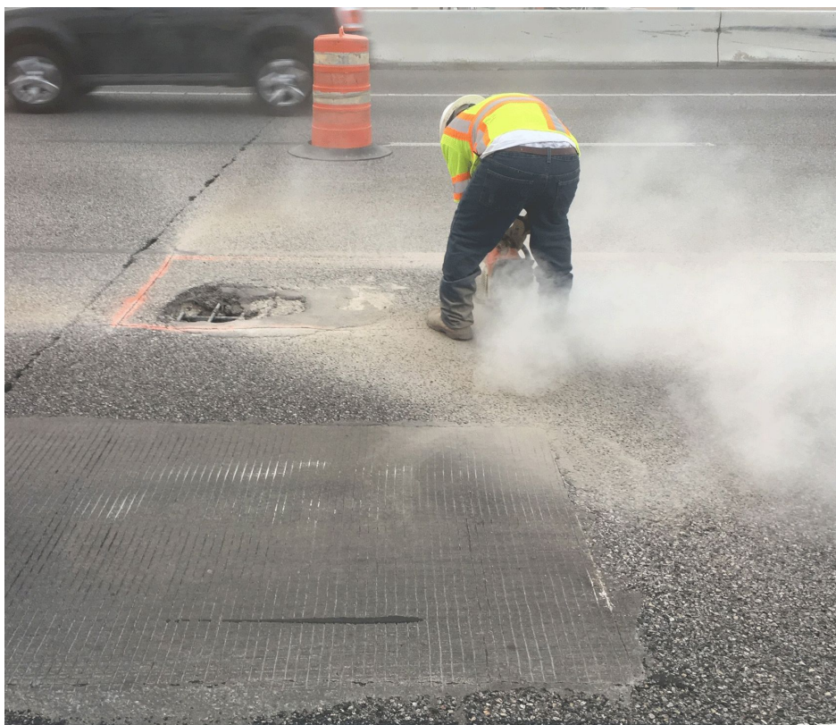
Figure 3-9. Saw-cutting along defined repair boundaries