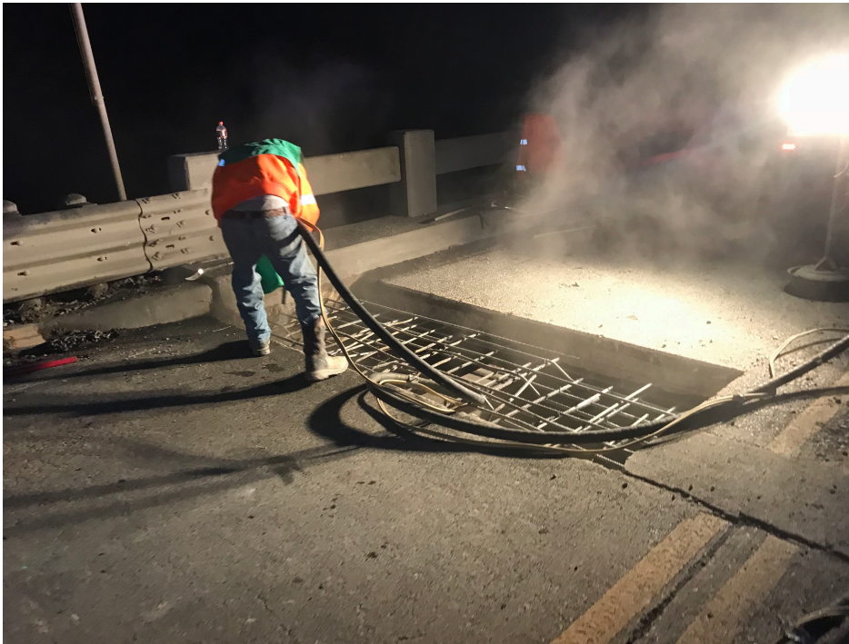
Figure 3-12. Repair area preparation (high-pressure water blasting, or other approved methods to remove dust and debris. Abrasive blasting to remove rust from exposed steel surfaces)