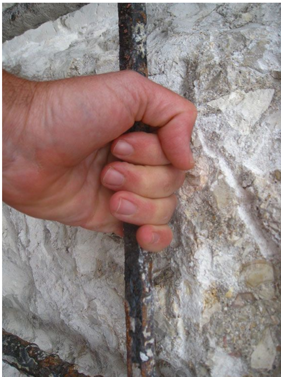
Figure 3-4. Verifying adequate clearance around reinforcing.