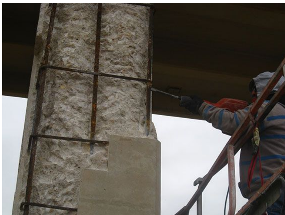
Figure 3-3. Chipping hammer used to remove unsound concrete.