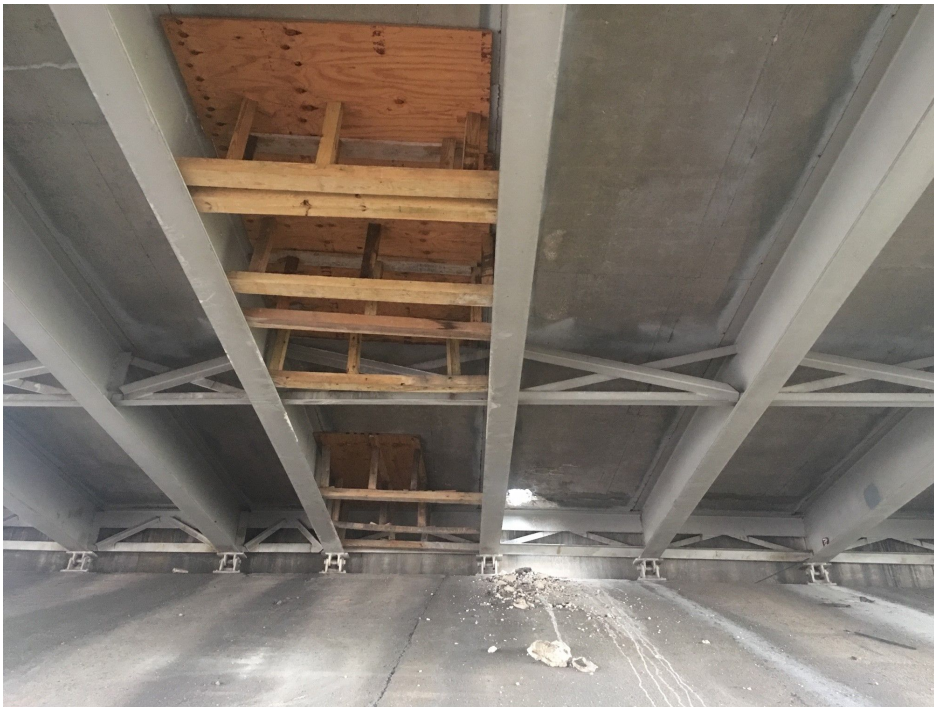
Figure 3-11. Installation of formwork