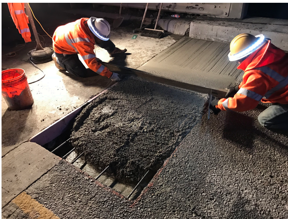
Figure 3-14. Finishing the concrete