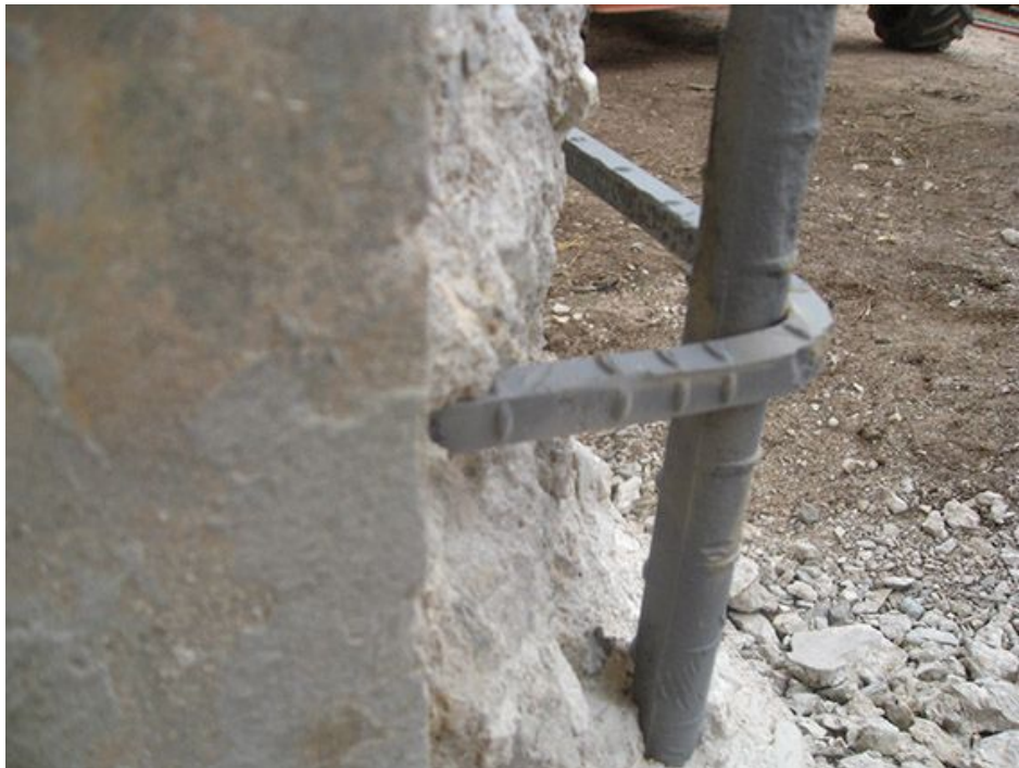
Figure 3-6. Reinforcing cleaned and free of rust.