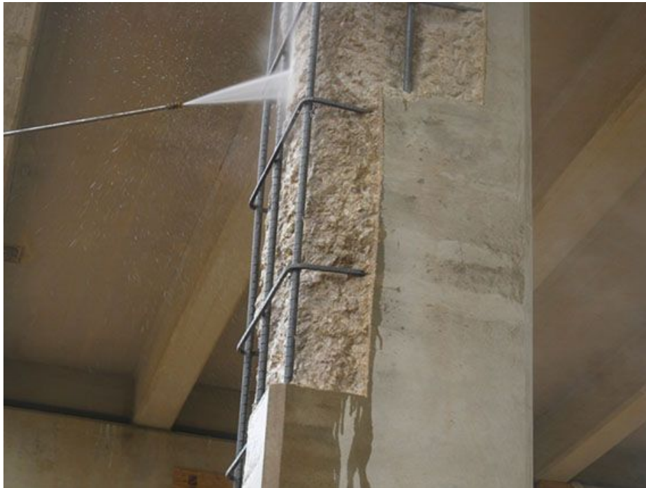
Figure 3-7. Pressurized water to clean and prepare surface (saturated surface dry).