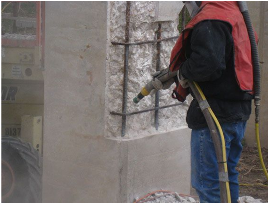
Figure 3-5. Abrasive blasting to clean reinforcing of rust/active corrosion.