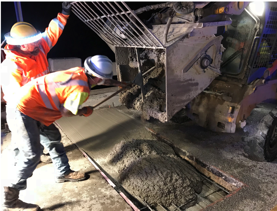
Figure 3-13. Placing the concrete