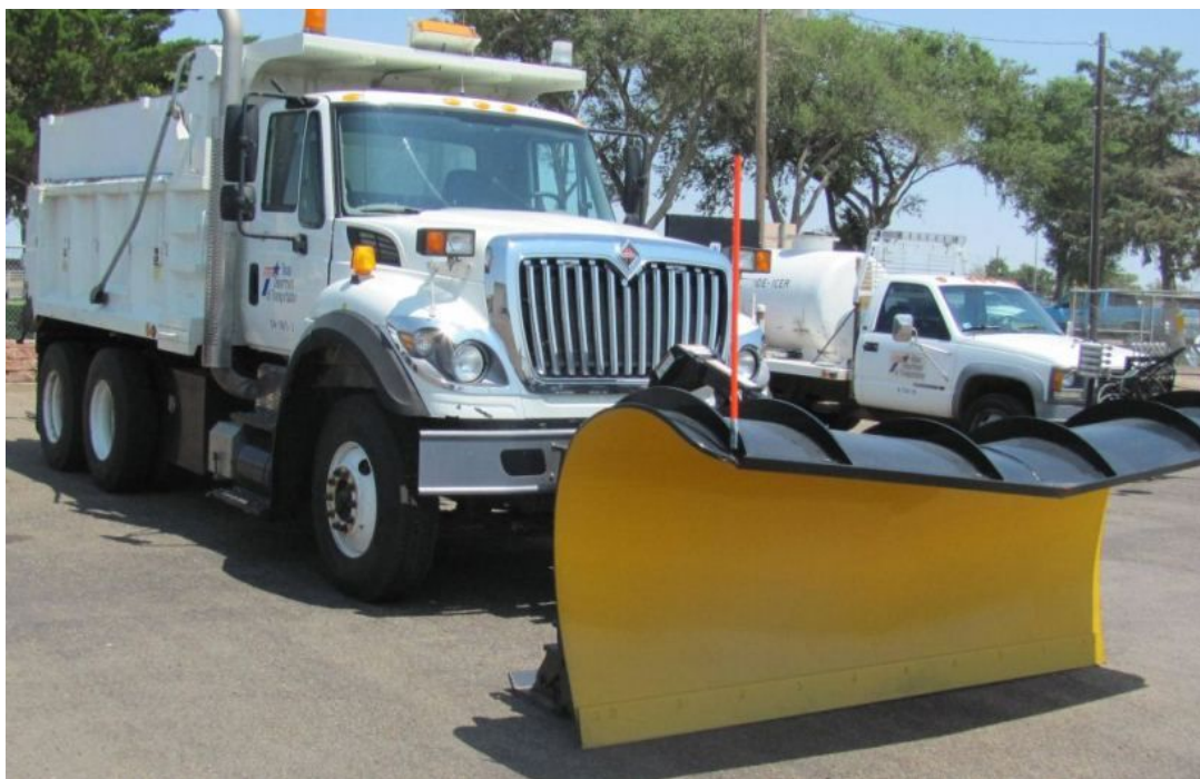
Figure 3-4. The Snow Plow is an attachment for a six- and 10-cubic yard truck. It is used to remove snow from the pavement.