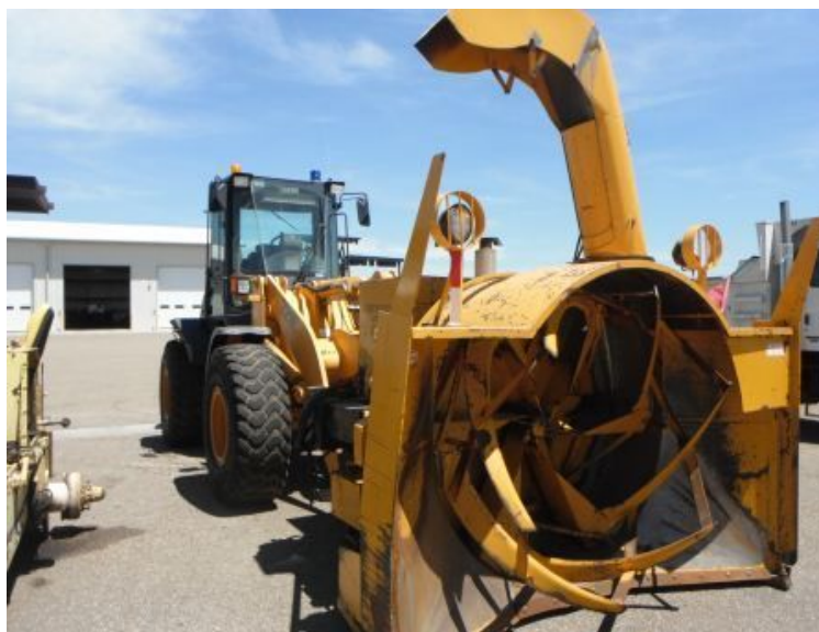
Figure 3-8. Snow blower is an attachment that is used to remove large quantities of snow.