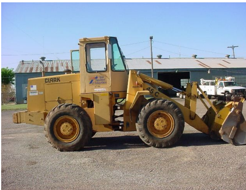
Figure 3-3. Loaders are a vital piece of equipment during a snow and/or ice event. They are used for loading material on the trucks to fight the ice and snow. They are also used to clear intersections and driveways.