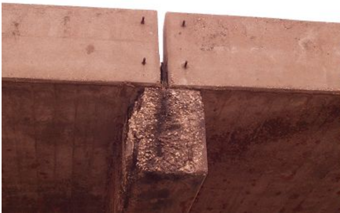
Figure 5-3. Poorly maintained joint allowed concentrated de-icer solution to damage cap.

TxDOT prefers bridge joint inspection and cleaning to be performed in the spring and re-inspection to occur prior to the beginning of snow season. This fulfills the annual bridge inspection criteria in accordance with the Maintenance Operations Manual