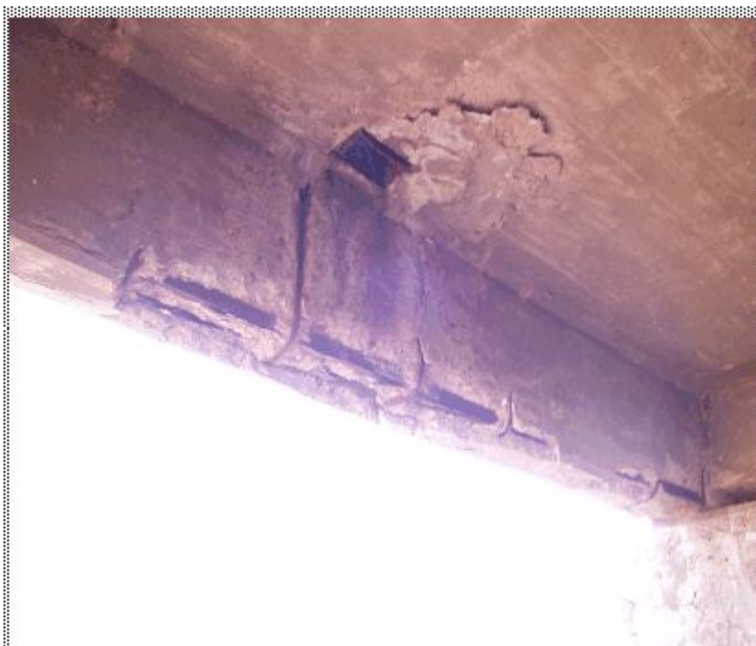
Figure 5-1. Corrosion damage due to concentrated de-icing solution at drain site.