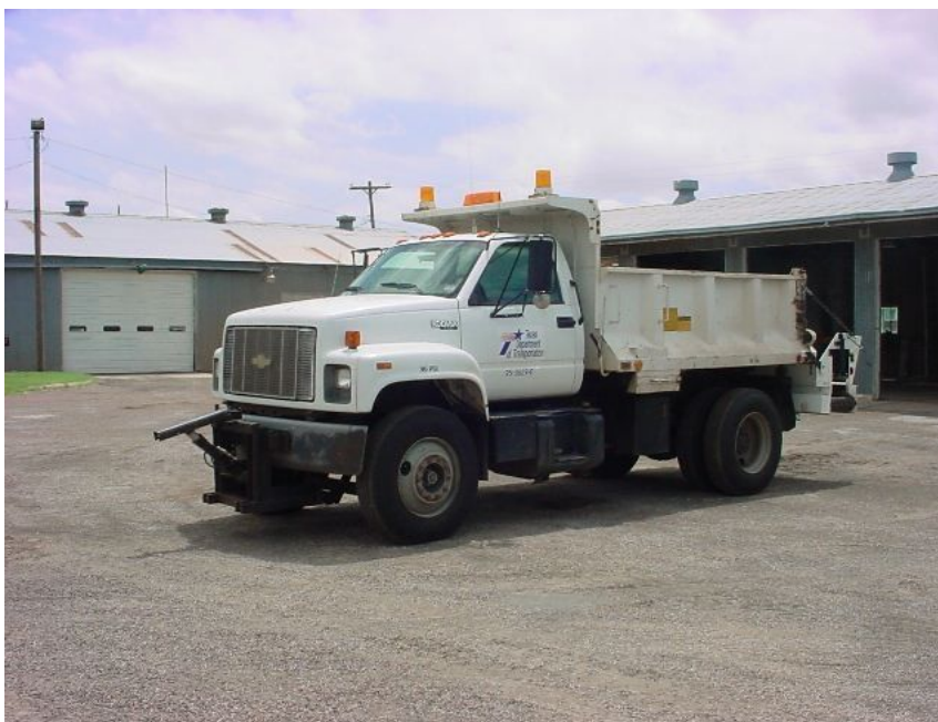
Figure 3-1. Dump trucks are the workhorses of TxDOT snow removal. Snow plows are mounted to dump trucks and are used to push the accumulated snow off the roadway. Spreaders are also mounted on dump trucks to facilitate the spreading of materials for snow and ice control.