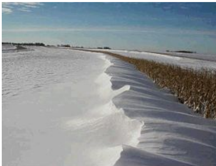
Figure 9-1. Living Snow Fence, courtesy University of Minnesota and Minnesota DOT.

Snow fences come in many different varieties and forms. There are the traditional wood fences, high-density polypropylene fabric, extruded polyethylene and even living snow fences. Living snow fences are designed plantings of trees and/or shrubs and native grasses located along roads or around communities and farmsteads. Properly designed and placed, these living barriers trap snow as it blows across fields, piling it up before it reaches a road, waterway, farmstead or community.