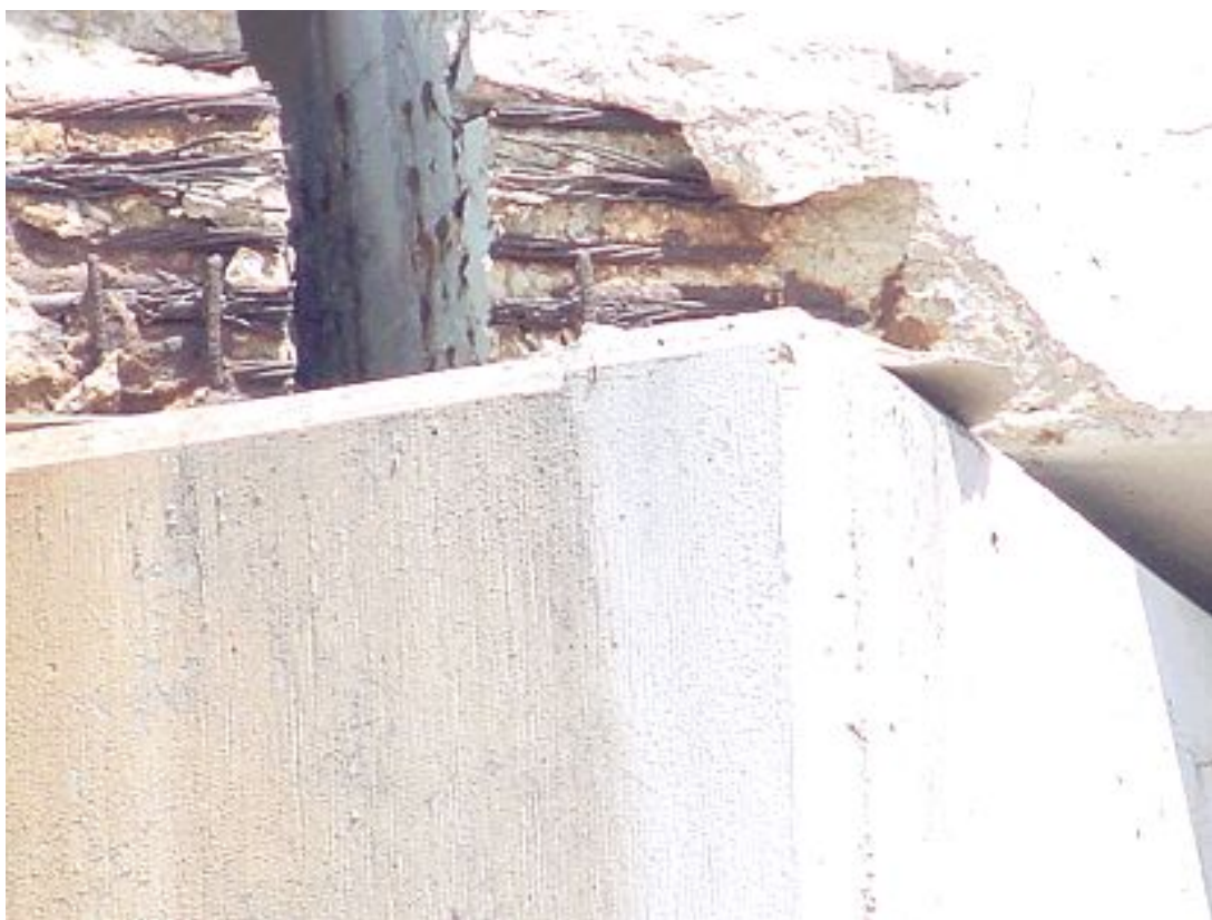
Figure 5-6. Close up of Figure 5-5.