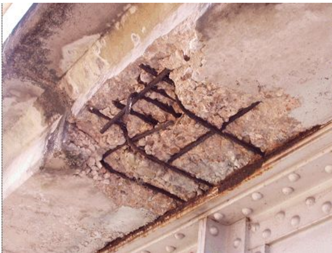
Figure 5-4. Poorly maintained joint allowed de-icer solution to damage overhang to second mat of steel and top plate steel on beam.