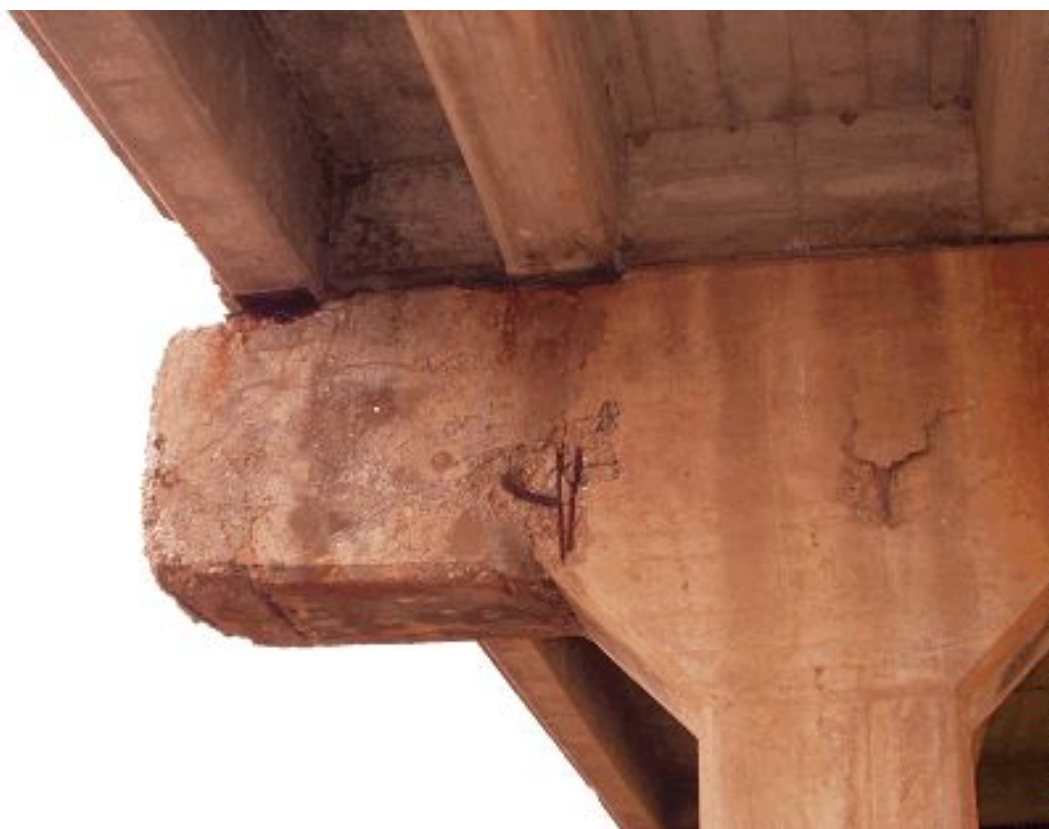
Figure 5-7. Corrosion induced damage in high stress cantilever design.

Maintenance personnel should maintain joint systems, eliminating the possibility of chemical solution saturating this structural element. If joint systems have failed, or are designed as an open system, caps should be washed at the end of snow season.