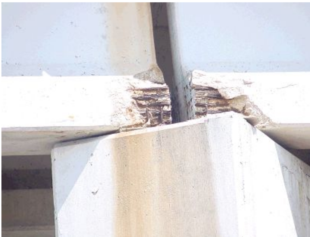
Figure 5-5. Chemical solution corrosion induced beam damage created by failed joint and poor concrete cover over beam ends.

Maintenance personnel should repair and maintain joint systems ensuring the protection created by the sealed joint systems.