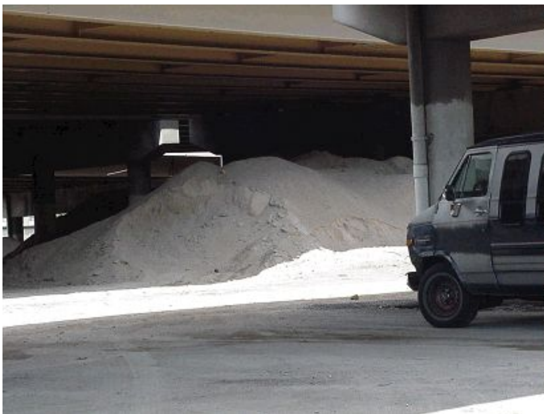
Figure 5-11. Salt storage under a bridge next to bridge columns.