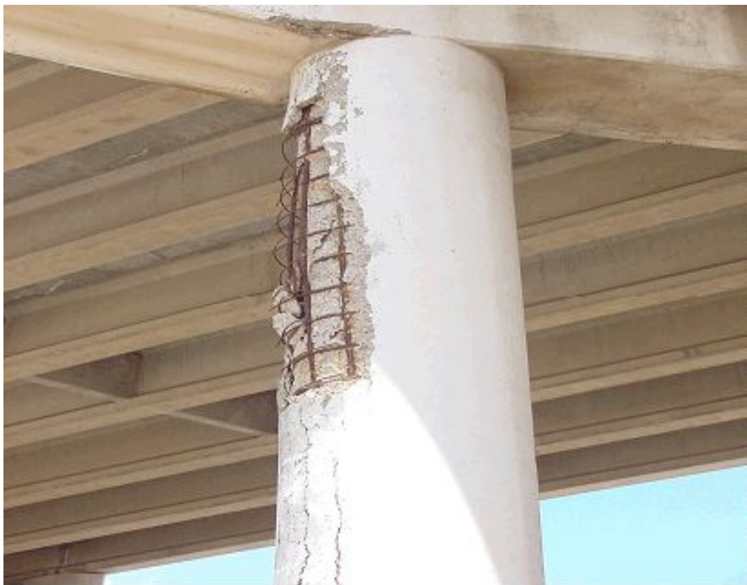
Figure 5-9. Column deterioration from chemical solution contamination.

To eliminate chemical damage to columns, do not store chemical materials next to columns and maintain and repair bridge joints.