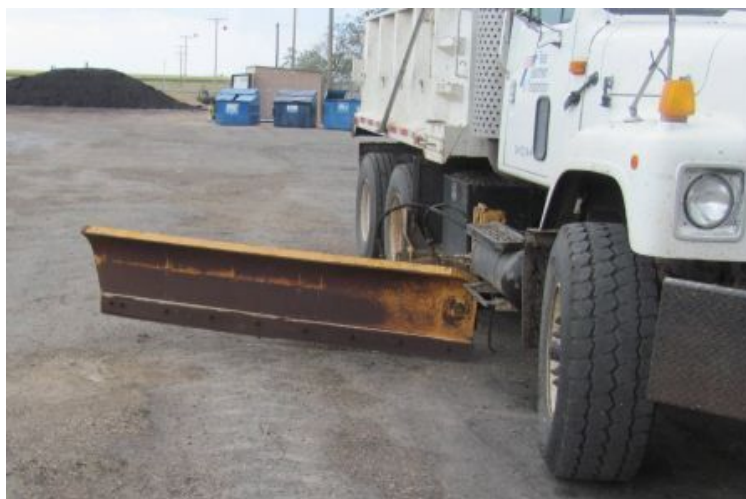
Figure 3-7. The snow wing attachment provides extra width on a motor grader or truck for plowing two lanes at a time or picking up a lane and a shoulder at the same time.