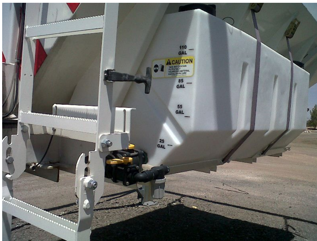
Figure 2-2. A saddle tank is a useful means of pre-wetting solid chemicals.

The practical result is a reduction in the resources necessary for maintaining the highway since a lower application rate translates into a spreader load covering more area, often requiring less deadheading (returning to the barn empty) to obtain material.