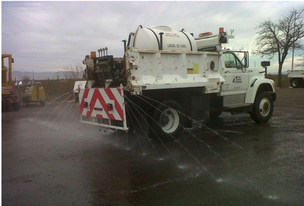
Figure 2-1. Application of liquid chemical by stream nozzles.