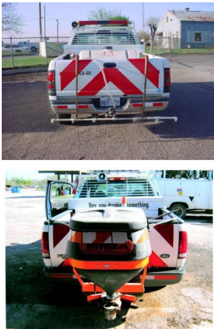
Figure 3-10. Pickup applicators are used to apply anti-icing liquids (top) and granular (bottom) materials prior to an approaching storm to small areas such as bridge decks, on and off ramps. They are also used for de-icing applications during the storm.