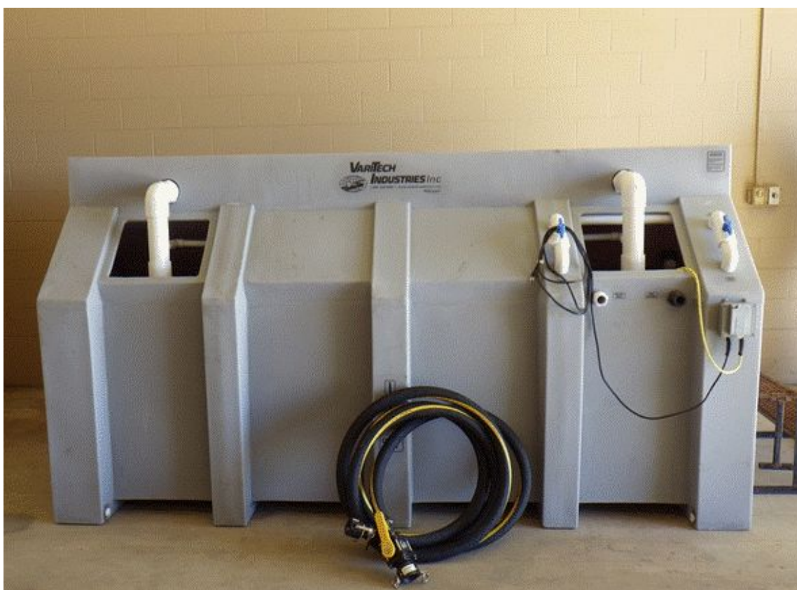
Figure 2-3. VariTech Industries Brine Maker