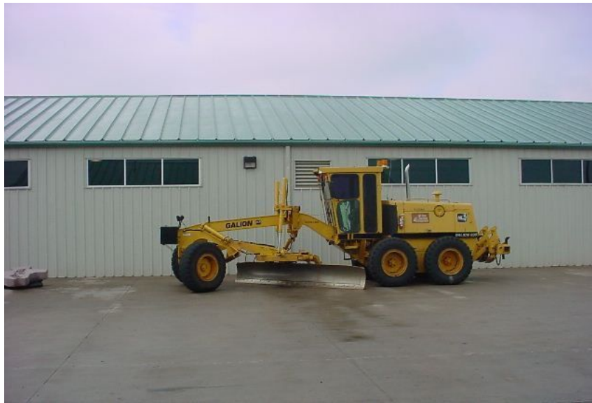
Figure 3-2. Motor-grader (maintainer) - This may be the best piece of equipment we have for snow removal. It does not require any other attachments to do the job. This piece of equipment is self-contained and ready to go.