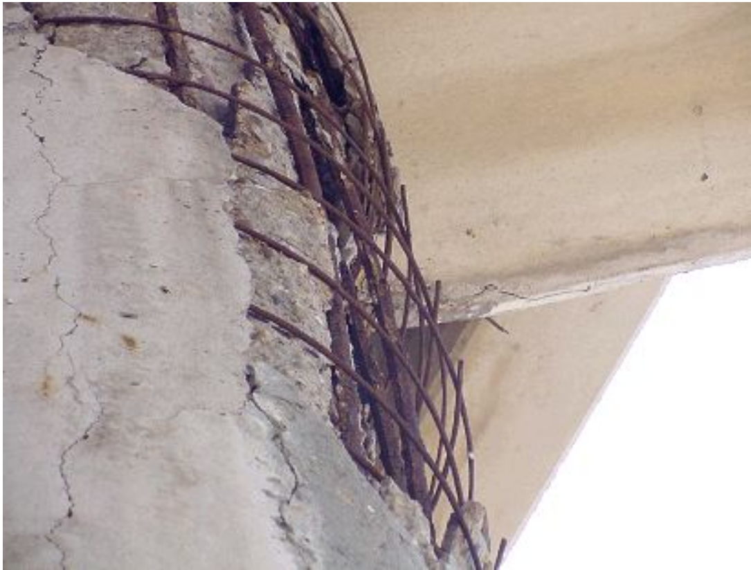
Figure 5-10. Close up of the damage. Notice the #9 bars are starting to buckle. Two reasons this could be happening: 1. Rust could be pushing on concrete causing the buckling. 2. The column could be shortening. This bridge was replaced after 20 years of service.