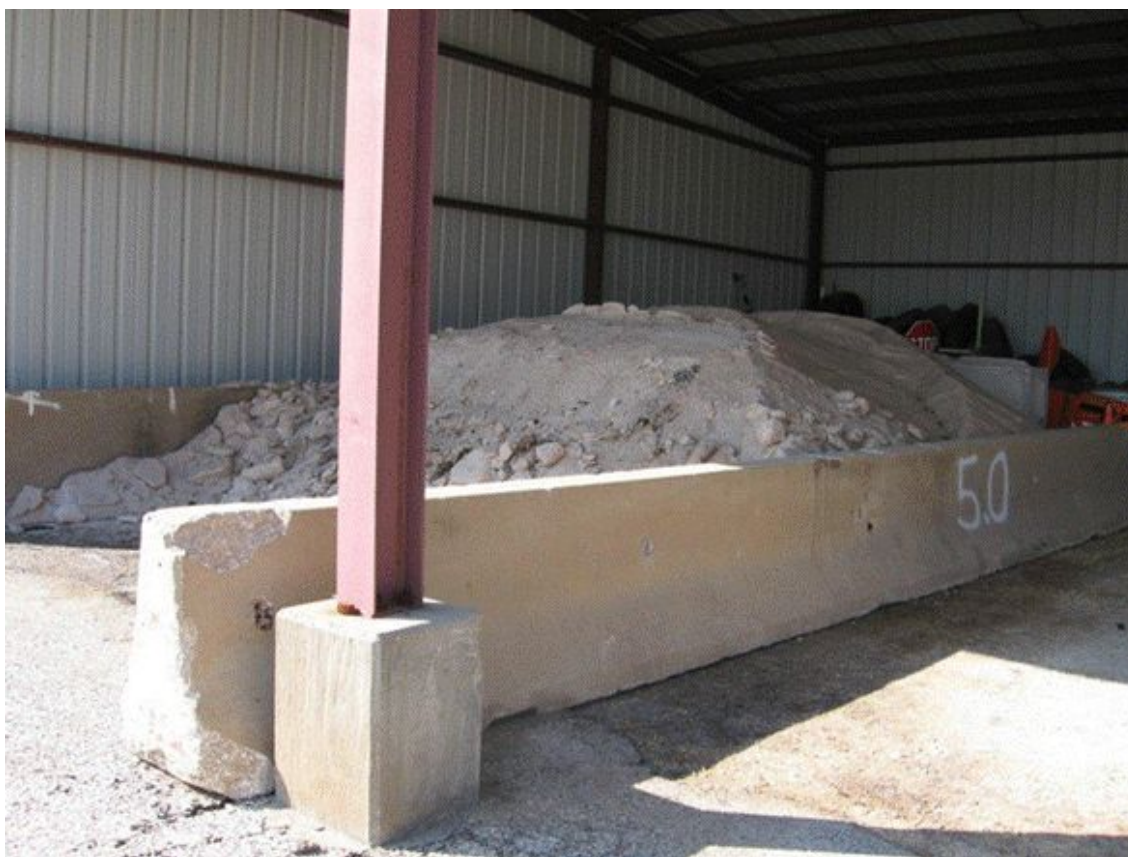
Figure 2-4. Salt Storage at TxDOT Maintenance Section Warehouse