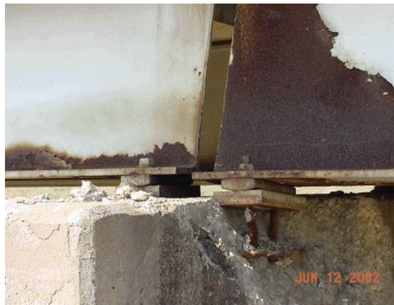
Figure 5-8. Failure on cap due to corrosion damage. Bridge was closed until repair could be performed.