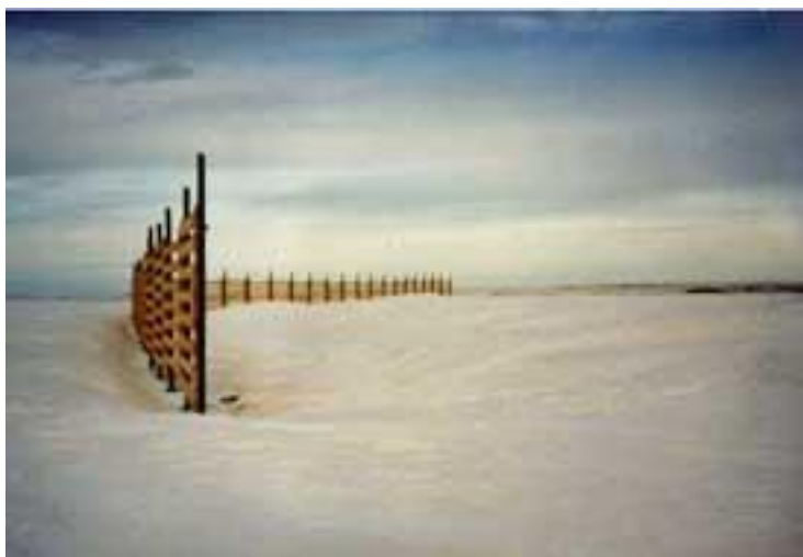
Figure 9-2. Wood Fence, courtesy University of Minnesota and Minnesota DOT.