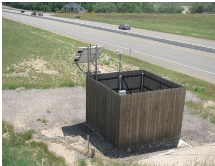
Figure 9-4. One means of achieving anti-icing is this automatic injection system in use in the Amarillo District. Photo shows chemical tank and controls, while the plumbing that gets the liquid to the road is underground.

There are two distinct snow and ice control strategies that have been gaining popularity and show promise in making use of chemical freezing-point depressants: de-icing and anti-icing. Anti-icing operations are conducted to prevent the formation or development of bonded snow and ice for easy removal, while de-icing operations are performed to break the bond of snow and ice and eliminate the buildup on the roads. See Chapter 2 , “Materials,” for information on the various chemicals available to use in these operations.