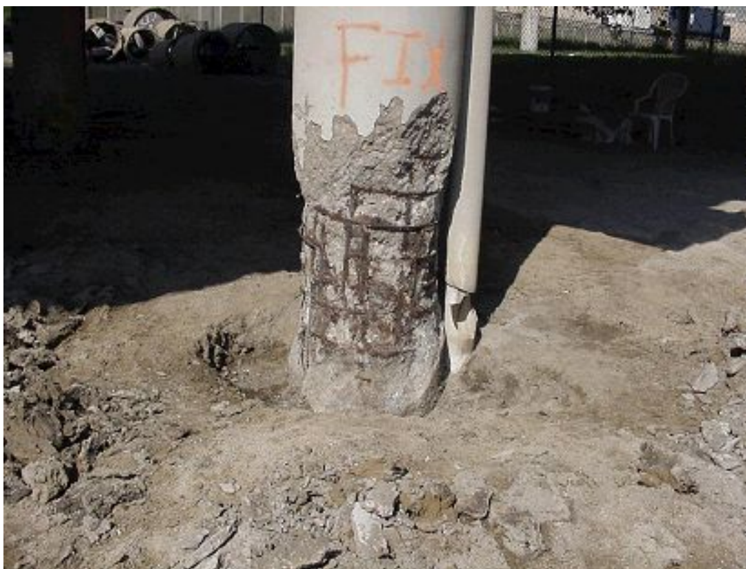
Figure 5-12. Damage created due to the salt storage.