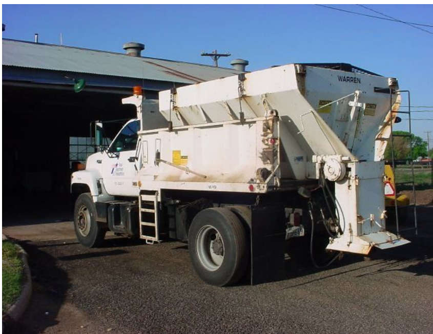
Figure 3-5. The V-Box Spreader is an attachment for a dump bed truck. It is used to accurately put out applications of de-icing materials on bridges and icy spots. These spreaders can either be hydraulic or gasoline operated.