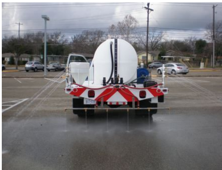
Figure 3-9. The herbicide rig is used to apply anti-icing liquids prior to an approaching storm. It is also used for de-icing applications during the storm.